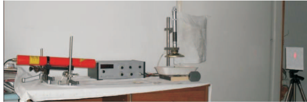
Figure 1: Photograph of the experimental set-up.

which is suitable for experimental determination of the surface tension. Apparatus for measuring the wavelength of capillary waves (Figure 1) consists of: signal generator, oscilloscope, speaker, micrometer, liquid, styrofoam container, screen, CCD camera, meter tape, thermometer and cardboard (or a metal plate). Capillary waves are induced by sinusoidal oscillations from the speaker that are transmitted on the plane booster 1 on the surface of the fluid.